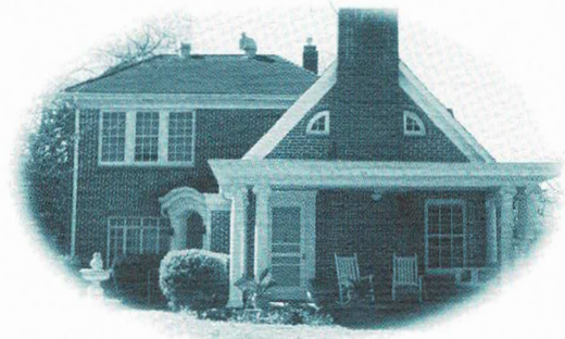
Harrell-Perkins House Georgian Revival 113 West 33rd Street

Situated between Guadalupe and Speedway streets, from 30th to 34th, its stone entrances may have been inspired by the so-called private places of St. Louis, small-scale, prestigious residential developments that were somewhat cloistered from their surroundings, usually with a central boulevard.