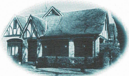
Simms-Diller House Jacobethan Revival 212 West 33rd Street