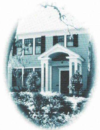
Theo S. Painter House Colonial Revival 105 West 32nd Street