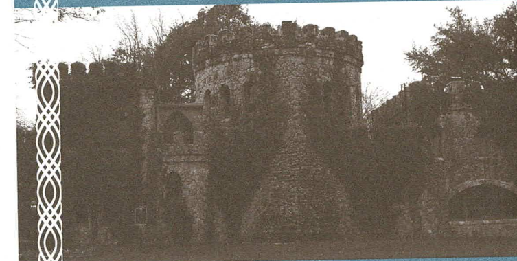
c: 1415 WOOLDRIDGE DRIVE