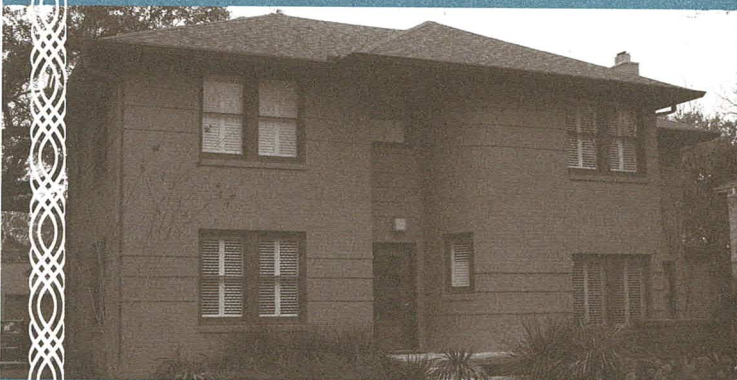
g: 1406 HARDOUIN AVENUE