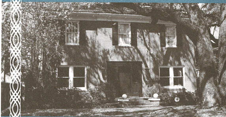
f: 1402 HARDOUIN AVENUE