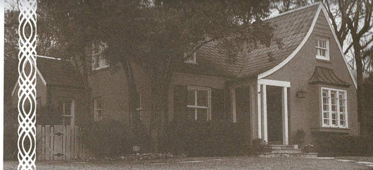
e: 2500 WOOLDRIDGE DRIVE

Combined with Old Enfield to the south and Brykerwoods to the north, Pemberton also forms the core of the proposed Old West Austin Historic District (OWAHD), which has been nominated for the National Register of Historic Places. Indeed, many contributing homes in Pemberton are subject to demolition or radical alteration, which would do irreparable harm to the neighborhood's historic fabric.