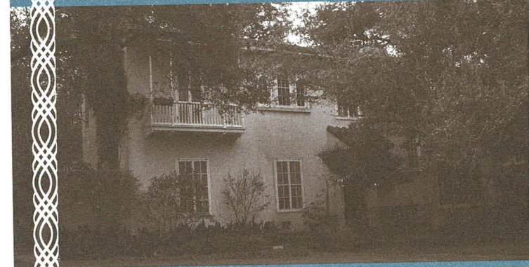
b: 1505 WOOLDRIDGE DRIVE