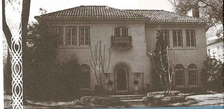
a: 2418 HARRIS BOULEVARD

Architecture in the neighborhood – bounded by Mopac Expressway to the west, 29th Street to the north, Shoal Creek to the east and Windsor Road to the south – represents three phases of primary development from the late 1920s to the early 1950s. Designs include a variety of revival styles – mainly Mediterranean, Tudor and Spanish Colonial – as well as Prairie School, Craftsman, Art Moderne, International and Ranch. While many of the homes are sizable, a good portion are not, reflecting an eclectic (and original) mix of middle- and upper-income properties.