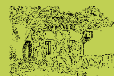
1300 Alta Vista