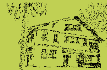
Stacy House 1201 Travis Heights Blvd.

Darjeeling black tea and Lemon Mint and Caribbean Afternoon herbal teas