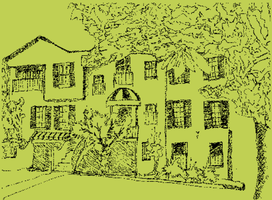
Ziller House 800 Edgecliff Terrace