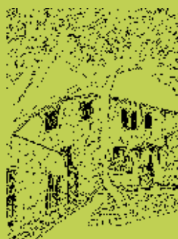
Reuter House 806 Rosedale Terrace

The Homes Tour will be launched in style at the stunning Reuter House, one of the jewels of Travis Heights. The home will not be on the tour, so the party will be a unique opportunity to visit the estate. Explore the lovely setting while enjoying delicious cuisine, cocktails, and music by XXXXXX.