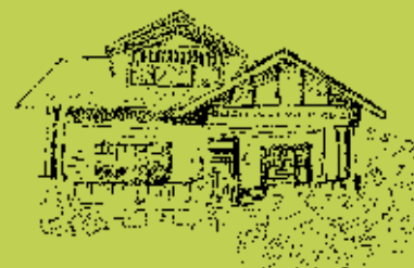
1200 Travis Heights Blvd.