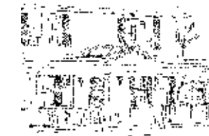
1308 Alta Vista

Advance tickets also available by visiting www.heritagesocietyaustin.org , calling 474-5198, or at the following consignment locations: