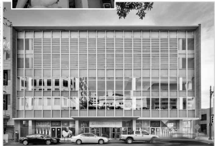
American National Bank Building