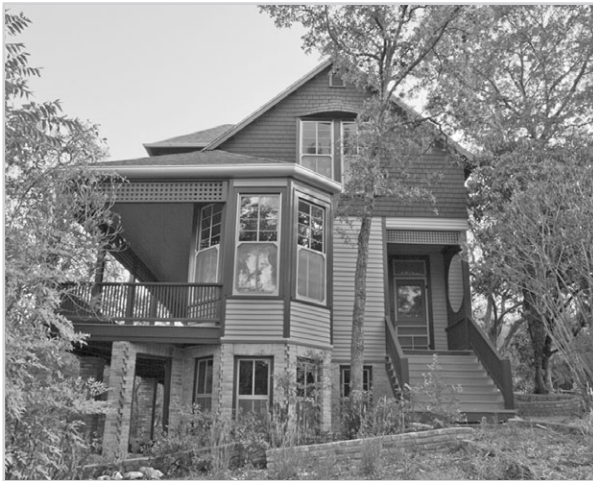
Alberto Garcia House