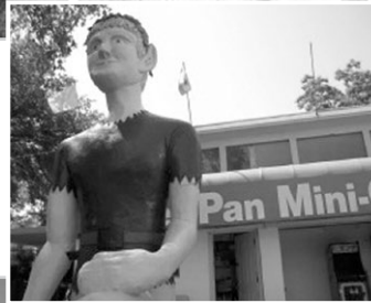
Peter Pan Mini-Golf