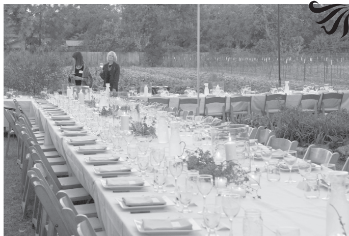
Guests enjoyed a sumptuous meal in the stunning and inspiring Boggy Creek setting.

The purpose of Inherit Austin is to cultivate a new generation of HSA members by hosting social, cultural and educational events that appeal to singles, married couples and families roughly ages 20-45. ♡