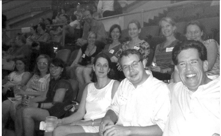
Inherit Austin members enjoy the classic "Dial M for Murder" at the historic Paramount Theatre

The Inherit Austin Board is also pleased that we have been invited into the strategic planning process for Preservation Austin so that we