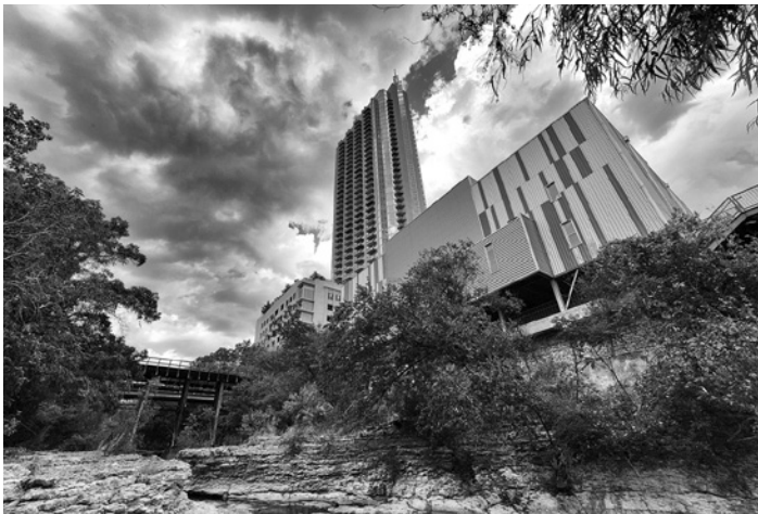
Shoal Creek at West 3rd Street Trestle