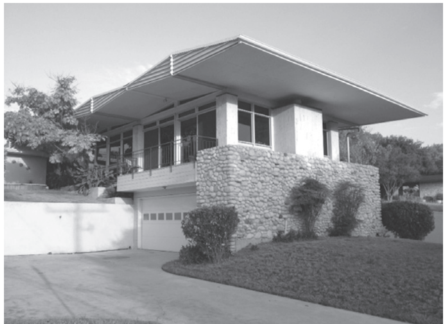
1964 Della Phillips House, 2310 E. MLK, Jr. Blvd.