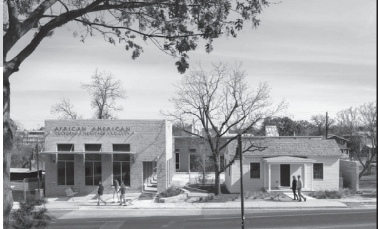
Dedrick-Hamilton House and African American Cultural & Heritage Facility