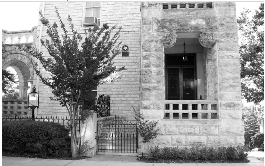
The North-Evans Chateau

You'll find room after room of hand carved curly-pine woodwork, ornate marble and tile fireplaces, pressed tin ceilings and stained glass windows – including a Star of Texas stained glass skylight! (Who knew they had skylights in the late 1800s?) The mansion is furnished with beautiful antiques, including a Tiffany-style lamp and gorgeous antique oriental rugs on intricate parquet flooring.