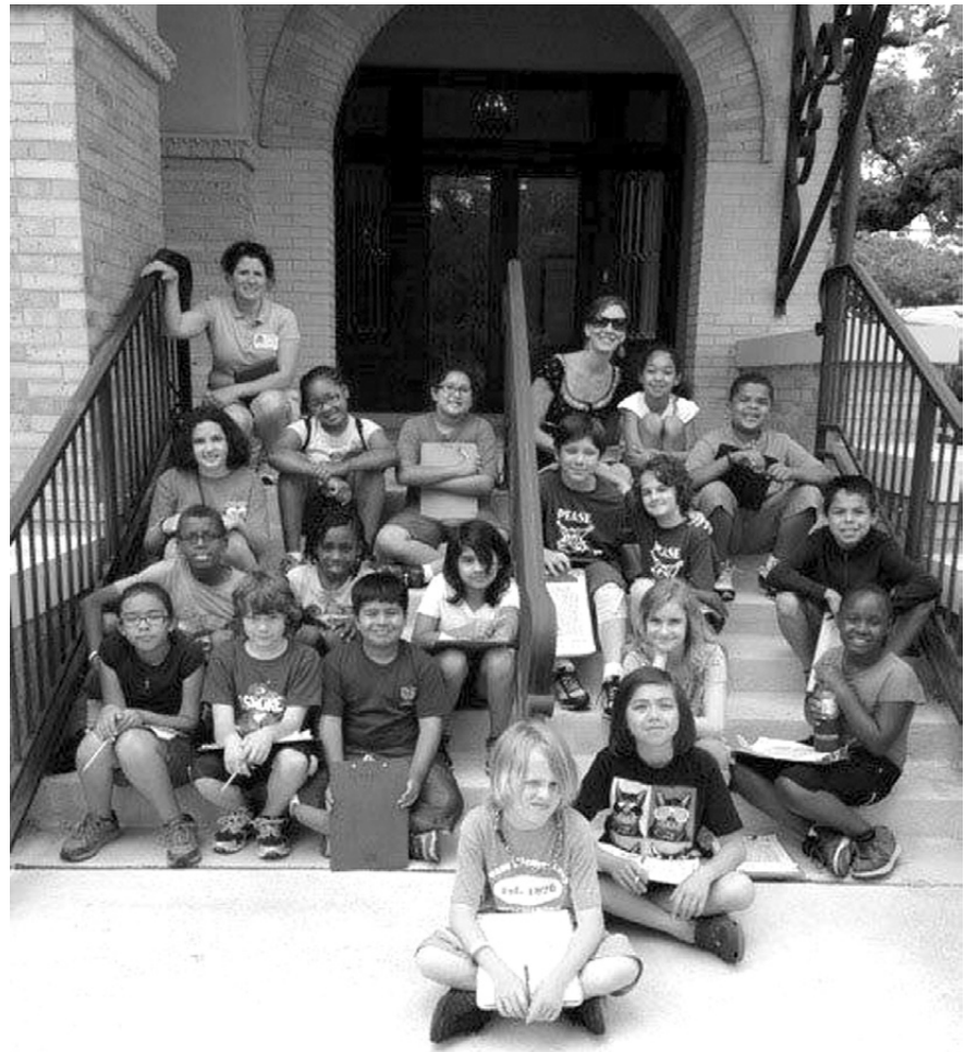
Pease Elementary students visit the Byrne-Reed House as part of their Judge's Hill tour.

The presentation exposed students to concepts such as surveying and