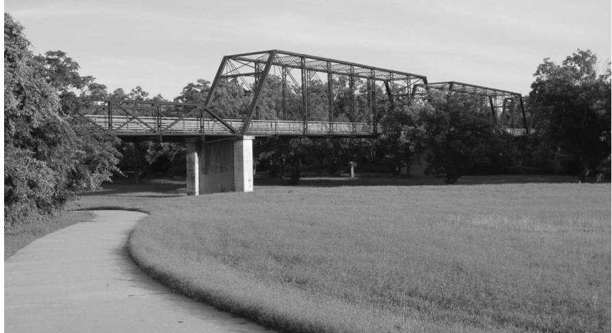
Moore's Crossing Bridge

L ooking over both our recent spring and upcoming fall events, I'm excited about the mix of venues available to us to enjoy historic Austin together. We have the opportunity to celebrate well-known landmarks that are dear to Austinite's hearts, congratulate local business owners who decide restoration is vital to their new venture, and still discover off the beaten path historic treasures.