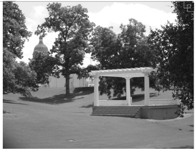
After a period of rest and some improvements, Wooldridge Square is looking wonderful.

Over the past year, Wooldridge Square, a downtown park that dates back to Edwin Waller's original 1839 plan for the city of Austin, has undergone a beautiful transformation. Please join us on Saturday, September 14, 2013 on Re-Opening Day for this historic square.