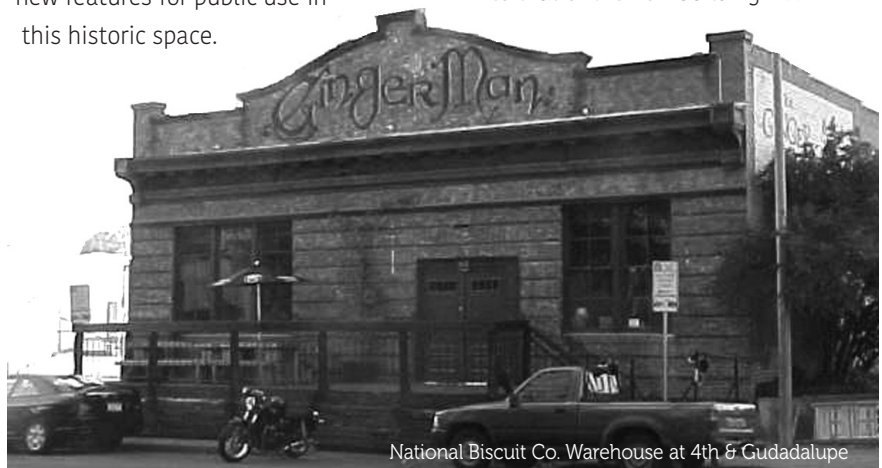
National Biscuit Co. Warehouse at 4th & Guadalupe