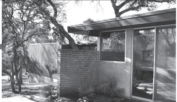
Dillard House, 4506 Crestway Drive

P reservation Austin proudly announces its 22nd annual Homes Tour to be held on April 5, 2014. This special tour will offer a snapshot of a transforming Austin, when Austin’s first tech company Tracor made its initial public stock offering, a group of friends first gathered to celebrate Eeyore’s Birthday Party, and a little honky-tonk named the Broken Spoke was built on the outskirts of town.