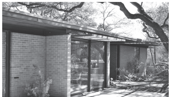
Crume House, 2603 La Ronde Street