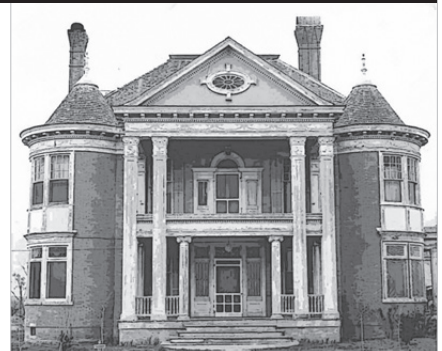
Commodore Perry Estate

S ave the date, May 29th, 2014, for this year's course on Buying and Selling Old Houses, to be held at the Ragsdale Center of St. Edward's University. The purpose of the course is to enable REALTORS® to enhance their effectiveness in serving clients who consider buying or selling old houses. This course is also open to homeowners who want to understand better their old house.