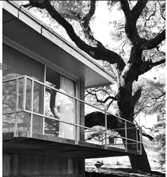
Thorne House, 3607 Balcones Dr.