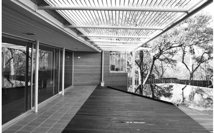
Fehr House, 5102 Ridge Oak Drive

Mercury Design Studio, Tarrytown Pharmacy, Urbanspace Interiors, and Zinger Hardware & General Merchant, or on day of event at all the featured homes (credit card sales only offered at 2603 La Ronde). $23 members / $28 non-members/ $23 Children 12 and under. To buy tickets or for more information on the tour, map, and FAQ, visit www.preservationaustin.org .