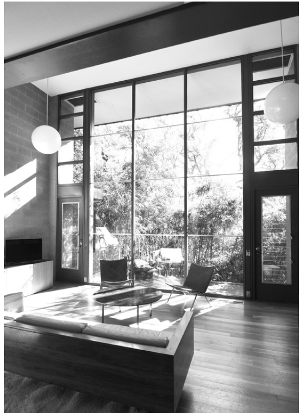
Cranfill-Beacham Apartments, 1911 Cliff Street