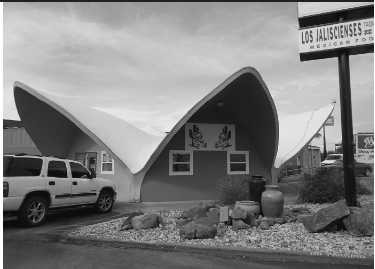
Taqueria Los Jaliscienses on US 290 East at Sheridan Avenue has a lotus-blossom roof, one of the more innovative and futuristic rooflines in Austin. The original windows for this Mid-Century Modern commercial buildings has had its windows replaced recently.