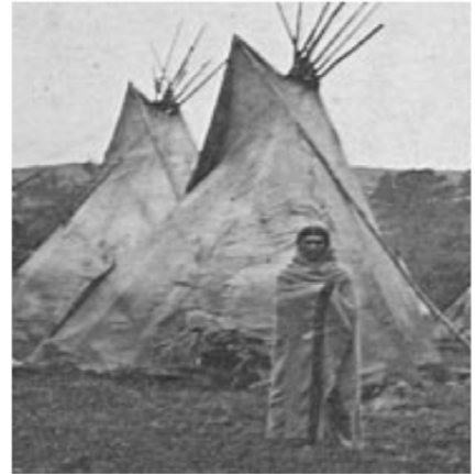
Tonkawa Tribe of Oklahoma

Contribute online at PioneerFarms.org or email us at PioneerFarmsAustin@gmail.com for a donor brochure with all the details.