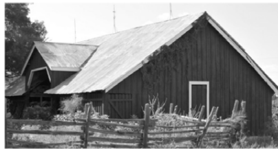
Pioneer Farms, both