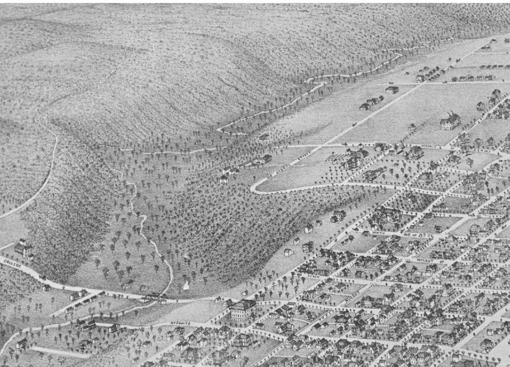
Shoal Creek bird's eye map