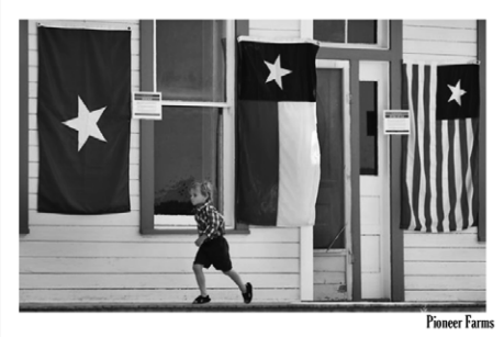
Independence flags from U.S., Texas will be part of the show.

See PioneerFarms.org for more details and tickets.