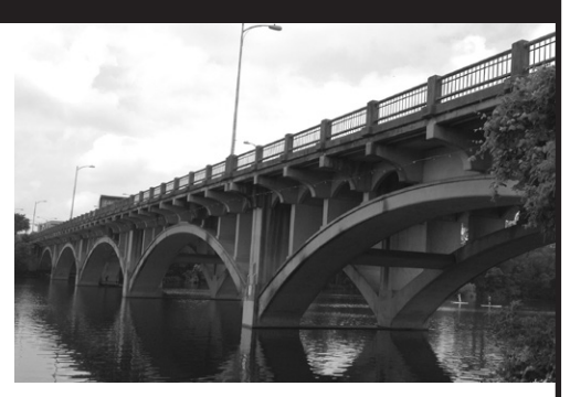
Lamar Boulevard Bridge

Lake) opened in 1942 along the new Lamar Boulevard that connected north