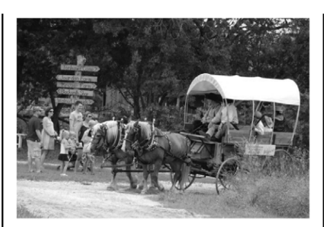
Independence Day will offer red-white-blue fun for all ages.

Check out the full schedule online at PioneerFarms.org and sign up to get a spot.