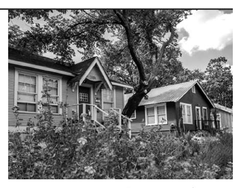
Blackland Neighborhood, featured on PA's new African American Austin app tour.

Unlike our previous tours, this one is supported by Otocast, a new mobile app platform. Otocast offers the same audio, image, and information-based features as our existing Historic Austin Tour Apps 1 and 2, yet is compatible with all smart phone operating systems and does not require costly updates. It currently offers over twenty arts-related tours across thirteen cities ranging from "Public Artwalk Dallas," supported by the Business Council for the Arts, to "Monuments and Memory," supported by the Lower Manhattan Cultural Council.