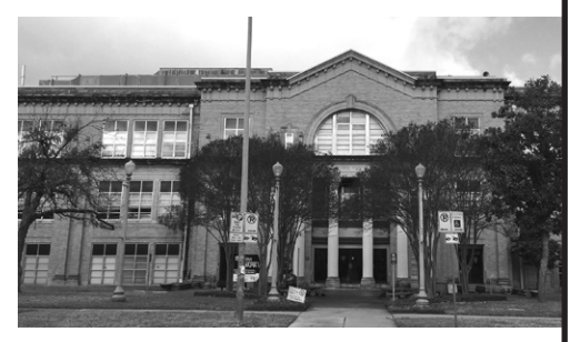
The former Austin High School

MAY: Austin High School's second building stands at 1212 Rio Grande Avenue, which is now a campus of the Austin Community College campus. The school was originally built in 1915 as the John Allan Junior High School. By 1924, the first Austin High School ran out of space, and the Junior High and Austin High traded buildings. Austin High began building additional classrooms at its "new" campus in 1925. In 1929, the school received a new gym, and in 1939 the school district constructed 24 additional classrooms, a Band Hall, and a tunnel under West Avenue to reach these buildings. By 1951, 3000 white students attended Austin