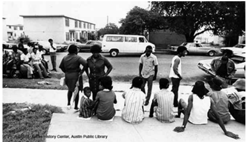
Protests at closure

Anderson's closure was an act of institutional racism that repeated itself across the South. When HEW forced true integration of schools in the 1970s, many districts chose to close the black high schools and make students attend formerly all-white schools. Others