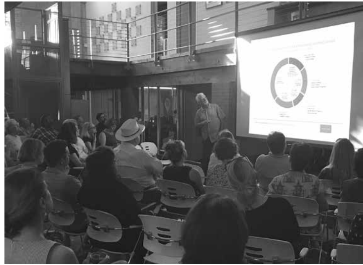
ADU presentations at Greening Your Vintage Home

Our 3rd annual History Hunt, scheduled for Bluebonnet Hills Neighborhood first in May, then in June, will be rescheduled to early 2018 after two torrential rain-outs. We hope the third attempt is a charm