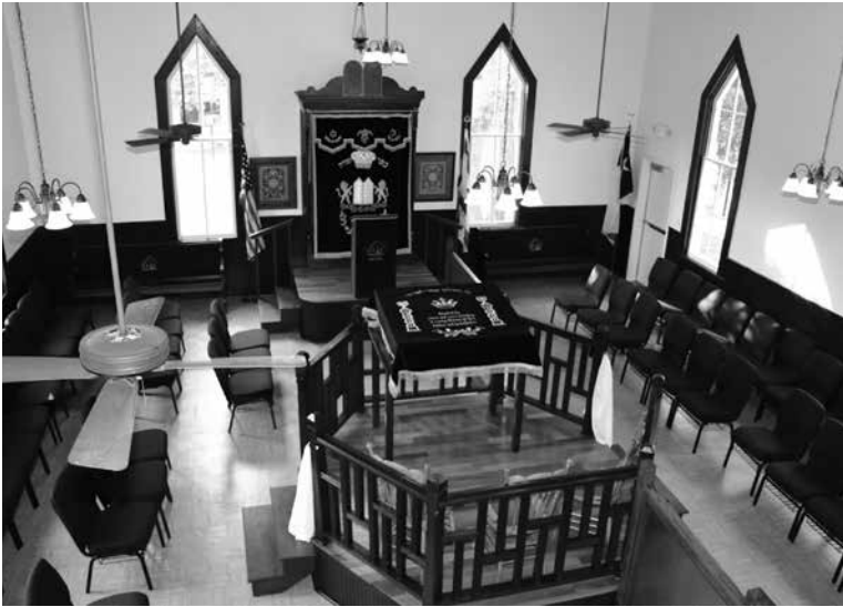
B'nai Abraham Brenham Historic Synagogue