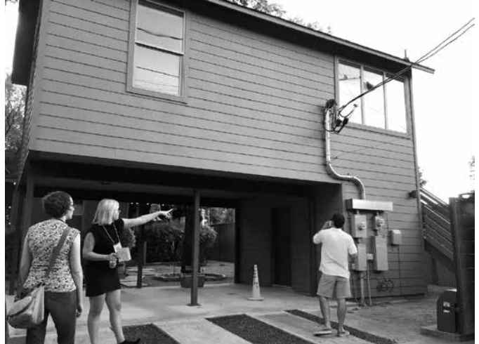
Exploring an ADU in the East Cesar Chavez neighborhood during Greening Your Vintage Home.