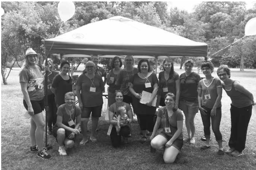
History Hunt volunteers – before the rain!

EDU and the Preservation Committee are also working in partnership with the “old” L.C. Anderson High School’s Alumni Association, and Austin Independent School District, to ensure that the rich