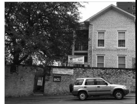
German Free School