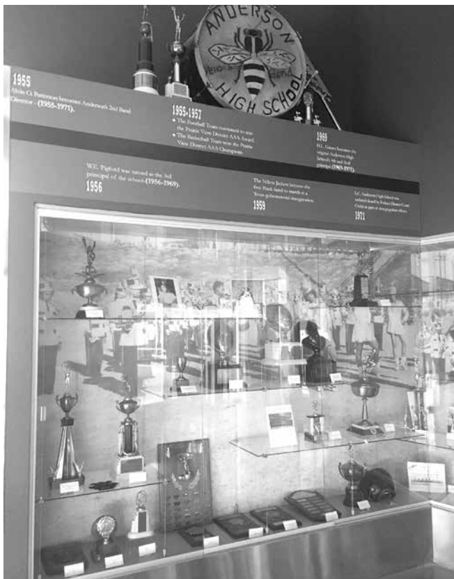
Current Anderson High School exhibit case

AISD is undergoing a facilities master planning process to support a $1 billion bond request in November 2017. AISD plans to move Eastside Memorial High School and International High School to the old Anderson campus. Preservation Austin is working with the Original L.C. Anderson High School Alumni group and AISD to recommend spaces and features on the school campus to preserve. The groups applied for a Texas Historical Commission Undertold Marker and are considering listing the school and campus in the National Register of Historic Places. The story and place of Austin's only black high school deserves to be preserved and remembered. ★