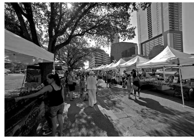
SFC Downtown Farmers' Market at Republic Square

For more information about Our Austin Story , go to the website at www.downtownaustin. com/ouraustinstory, and share your stories of and experiences at Austin's SFC Down original civic spaces, our historic squares, at engage.downtownaustin.com/our-austinstory. ★