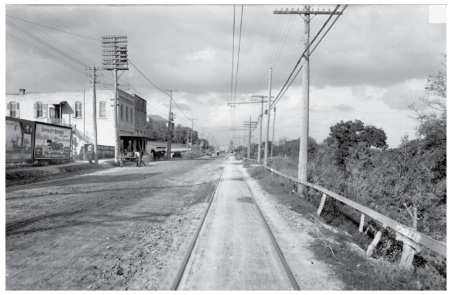
South Congress looking north towards the Capitol, at Academy Drive, in 1914.

Hundreds turned out to see their dreams realized with the inaugural run of the new streetcar in 1911. As noted by the Austin Statesman, "South Austin... has been straining at the leash, so to speak, and demanding the removal of the handicap to its growth for a long time. All it has asked has been a chance, and now that it has its magnificent bridge and its streetcar facilities, a phenomenal development may be looked for." New residential streets, lined with shining new bungalows, flourished and provided affordable homes for Austin's working and middle-classes. South Congress Avenue, formerly a country road connecting Austin to San Antonio,