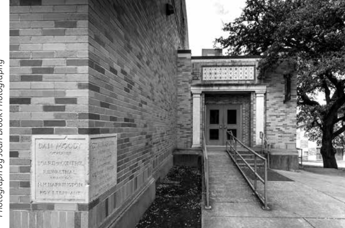
Clinger Gym, Texas School for the Deaf

lane basement bowling alley, planned for restoration, will be off-limits on tour day.