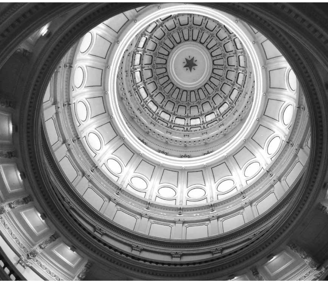
Legislative Session, continued from page 12

later added $1.5 million back in for the Heritage Trails program. However, (at the time this article is written) the House version still does not include any funding for either of those programs. With dozens of Counties ready and waiting to restore their courthouses and the THC managing 21 sites across the state, there