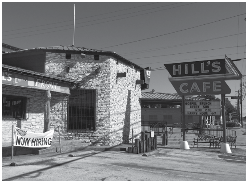
Hill's Café: 4700 South Congress Avenue. Charles Goodnight opened Hill's Café in 1947 to serve patrons at the adjacent Goodnight Motel. The café began as a small coffee shop and restaurant named after Goodnight's business partner, Sam Hill.

L ong before our travel woes on Interstate 35 and Mopac, long before Austin's development into a tech and live music mecca, the capital of Texas was just another stop along the Meridian Highway. Stretching from Winnipeg, Canada to Monterrey, Mexico, the Meridian Highway presaged the construction of I-35 and our modern highway system. In the early twentieth century, Texas' roads were often impassable due to weather or poor construction. A movement first spearheaded by bicyclists, known as the Good Roads movement, led to the formation of national groups dedicated to improving roads across the United States. Ultimately, the federal government stepped in to provide funding, and the Texas Highway Department (THD) came into being in 1917 to tap those federal dollars.