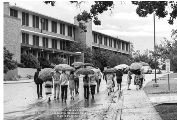
Despite the rain, Somewhere In Time guests enjoyed the walking tour of the historic Huston-Tillotson University campus.

Inherit Austin is looking forward to some exciting events and efforts in 2017! Be sure to check our Facebook page for announcements of our "Last Hurrah" events, in which we show some love to a long-time Austin business that will sadly be facing the wrecking ball. Inherit Austin started this new effort in December at Doc's on South Congress, housed in a historic automobile garage, which will be demolished in the Spring of 2017 to make way for new construction. Mark your calendars for our next event on January 19th,