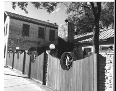
Old Depot Hotel