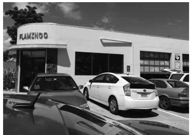
James Hershel Service Station: 3512 Guadalupe Street. Now Flamingo Automotive Repair, this service station opened in the late 1930s with a distinctive Art Deco architectural style. The canopy over the gas pumps and the service bays are still visible on the building.