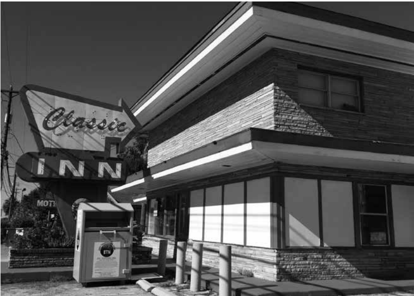
Goodnight Motel: 4702 South Congress Avenue. Opened in 1941 to catch the tourist trade between Austin and San Antonio, the Goodnight family ran this motor court-style resting place for decades. Now known as the Classic Inn, the individual buildings of the motor court and the mid-century modern office building still welcome weary travelers.

at The Triangle. Travelers had a choice to stay on Guadalupe Street until its intersection with West First Street (now West Cesar Chavez Street) and head east to Congress Avenue, or to head east on Nineteenth Street (now Martin Luther King, Jr. Boulevard) and then turn south on Congress Avenue and go through Capitol Square. The Meridian Highway then followed South Congress Avenue out of town toward Buda and San Marcos.