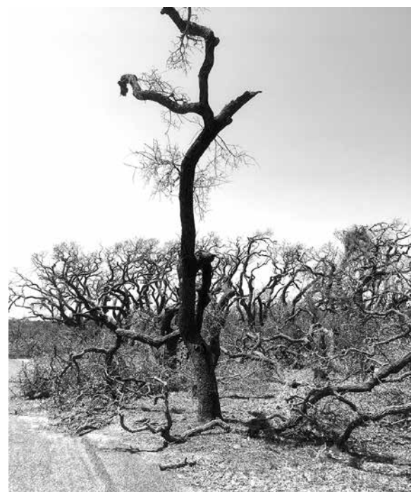
Goose Island State Park five days after Hurricane Harvey.

designed by the National Park Service and constructed by the Civilian Conservation Corps (CCC), had several feet of water in it during the storm. Repairs to the park are still on-going. In 2011, and again in 2015, Bastrop State Park suffered wildfires. The 2011 fire burned over 97% of the park. One month later Bastrop experienced four inches of rainfall in one night, which created flooding, erosion, and loss of two historic culverts along the park road. On Memorial Day 2015 Bastrop experienced yet another torrential rain and the historic dam washed away, draining the park's lake. The dam has yet to be rebuilt, and will cost more than $5 million to do so. The 2011 fire alone cost to date; $6.2 million on hazard mitigation, erosion mitigation, habitat restoration and natural/cultural