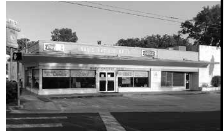
Nau's Enfield Drug