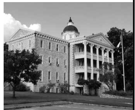
Austin State Hospital Administration Building