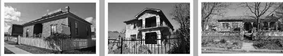
HHM & Associates

Anglo American, and Mexican American communities over time. GAIN hosted countless public meetings and did extensive community outreach to transform a potentially contentious process into an inclusive one based on shared values and building consensus. Volunteers contributed to the historic survey process, leading to an application prepared by HHM & Associates. Three years after the release of the City of Austin's East Austin Historic