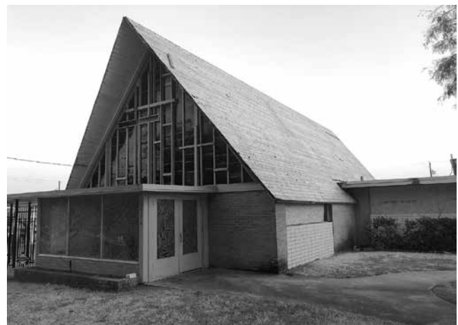
Prince of Peace Lutheran Church – before and after