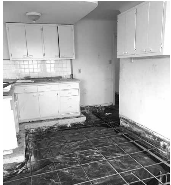
Kitchen before pouring the new slab.