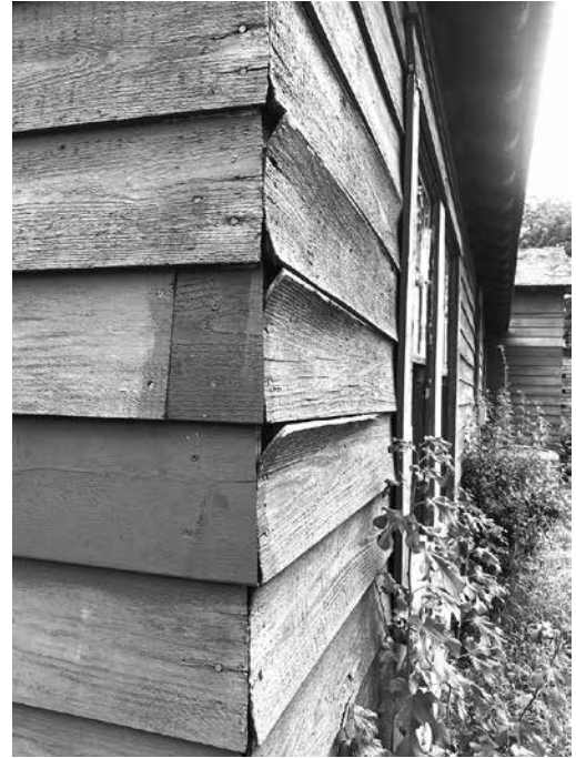
Fort Parker recreation hall in need of repair.

Proposition 5 is not a new tax, but will appropriate an existing sales tax on specific items to state parks. In the biennium just ended the amount was approximately $330 million. If passed, that level of funding can allow TPWD to address the backlog of needed repairs. The projects range from major repairs, to replacing aging security systems. The historic Wyler tramway at Franklin Mountains currently sits idle until funding is available to update its systems. The tram is inspected yearly but did not meet specifications this year so TPWD shut it down for the public's safety. Other projects include repairs and plumbing system upgrades to the historic "Big House" at Big Bend Ranch; completing roof repairs