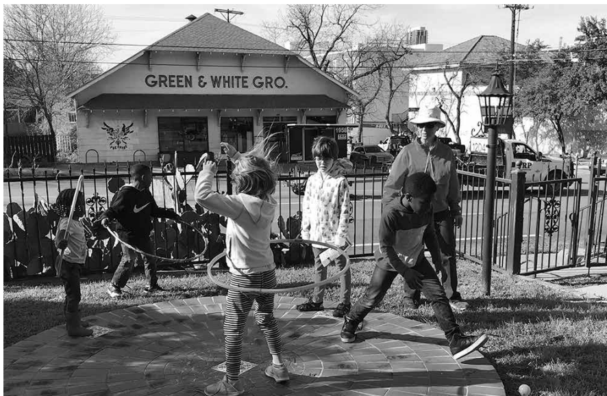
History Hunt in the Guadalupe Neighborhood