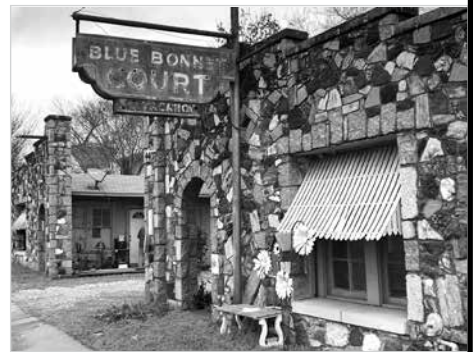
Blue Bonnet Court